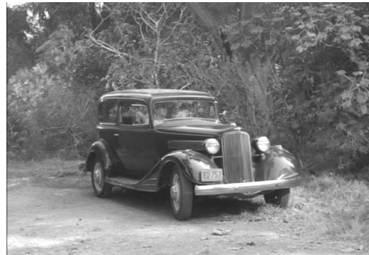
1934 Pontiac Eight in "The Andy Griffith Show"; (1960—1968); Season 3/Ep1