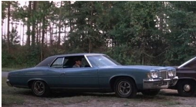
1972 Grand Ville in "Gator";(1976)