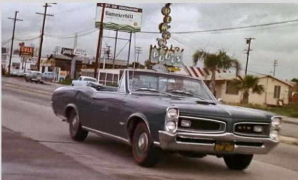
1966 GTO in "Targets"; (1968)