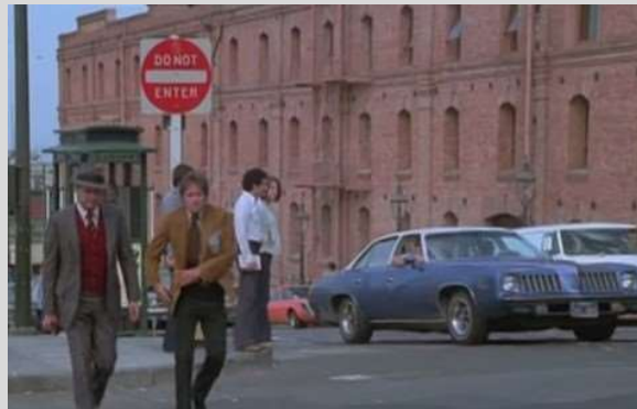
1974 Grand Am in "The Streets of San Francisco"; (1972—1977); S3/Ep12