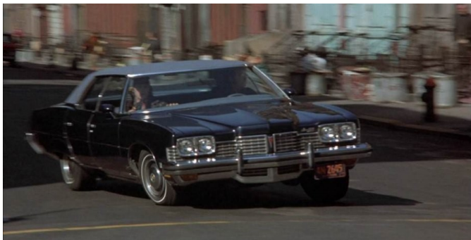
1973 Grand Ville in "The Seven-Ups"; (1973)