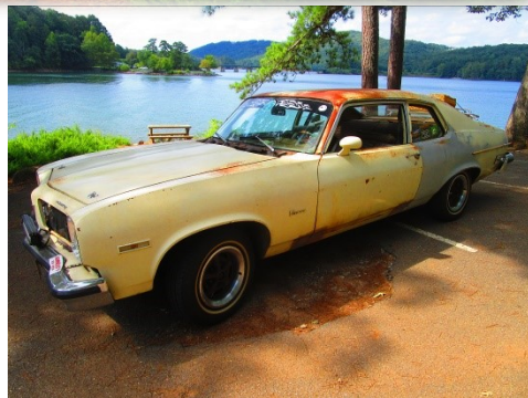
Kelly Ott—'74 Ventura