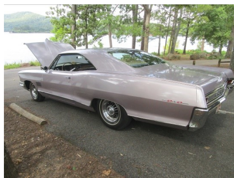
Karl Morrow—'65 2+2