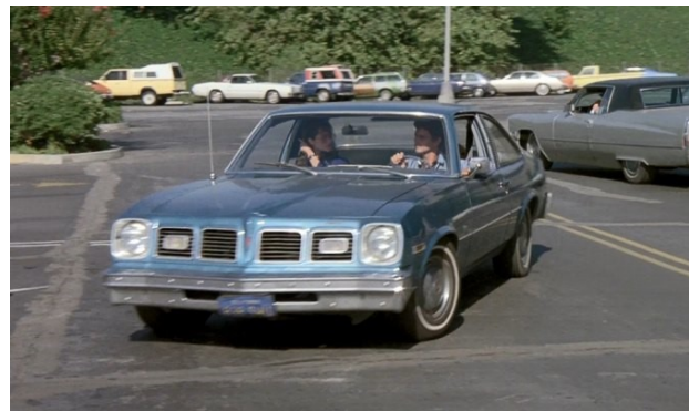
1975 Ventura in "Knight Rider"; (1982—1986); S2/Ep05