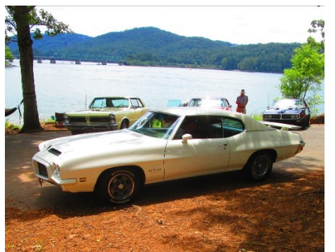
BJ Benton—'71 GTO