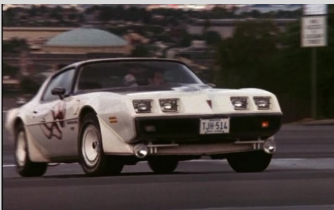
1980 Turbo Trans-Am in "Star 80" (1983)