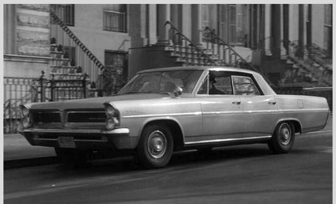
1963 Catalina in "Naked City" (1958–1963); S4.Ep14