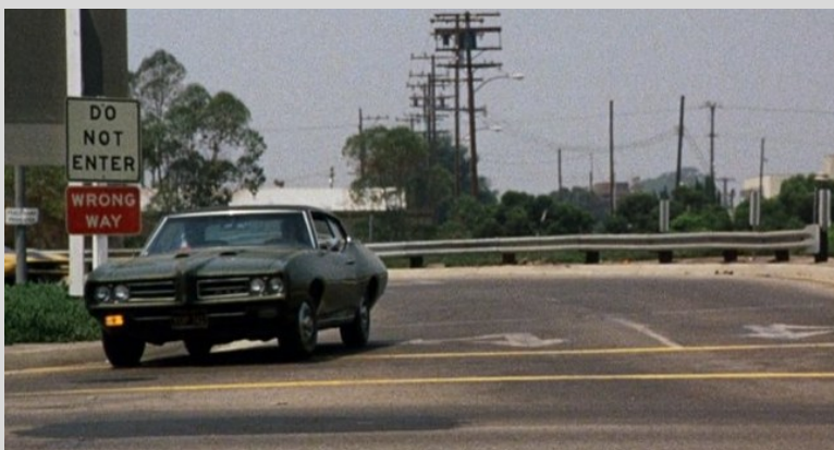
1969 GTO in "Gone In 60 Seconds" (1974)