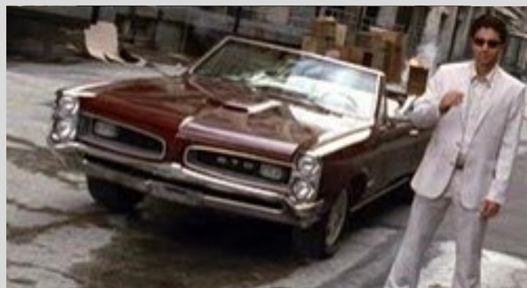
1966 GTO in "Entourage" (2004-2011); Ep.2.06)