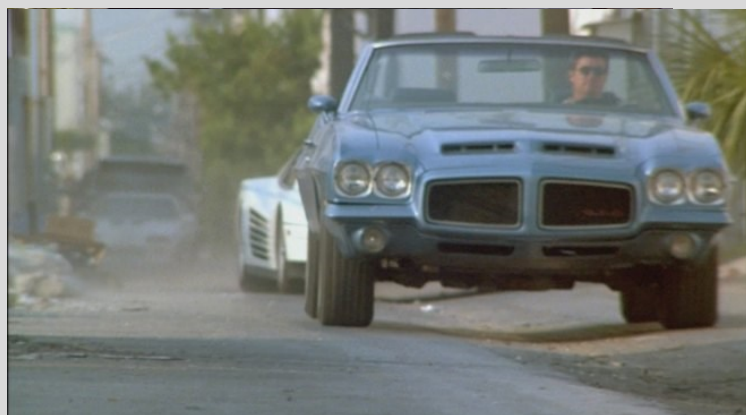
1971 GTO in "Miami Vice" (1984-1989); Ep.5.17)