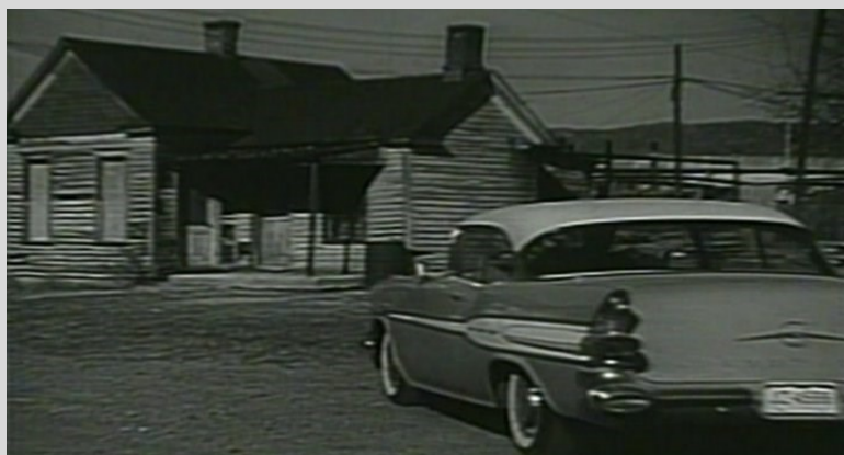
1957 Super Chief in "Anatomy of a Psycho" (1961)