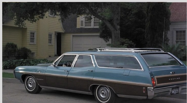
1968 Executive Safari in "I dream of Jean- nie" (1965-1970); Ep.4.06)