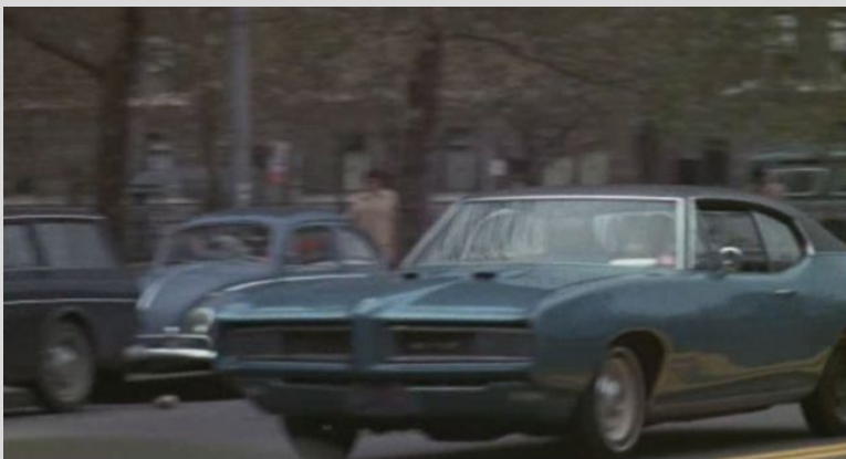
1968 GTO in "The Panic in Needle Park" (1971)