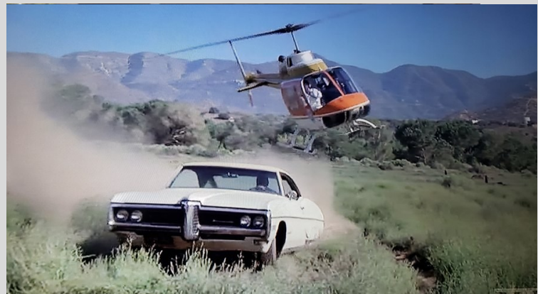
1968 Bonneville in "Charlie's Angels" (1976-1981); Ep.2.08)