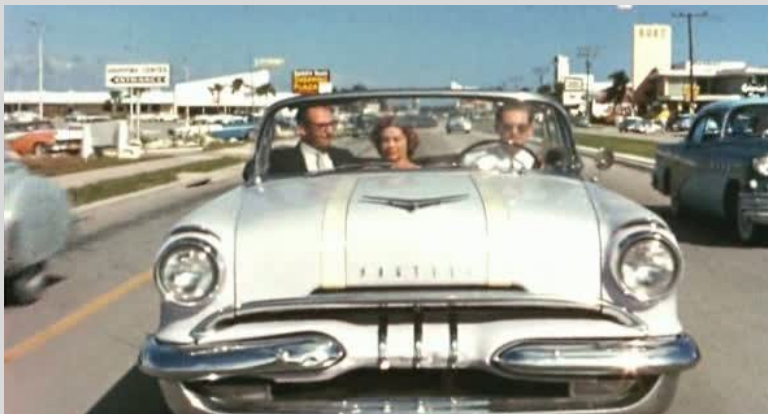
1955 Star Chief in "Hideout In The Sun" (1960)