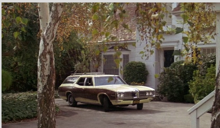
1968 Tempest Safari in "Daddy's Gone A-Hunting" (1969)