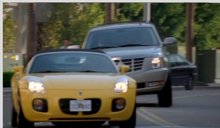
2007 Solstice GXP in "Prison Break" (2005-2009); Ep.4.18)