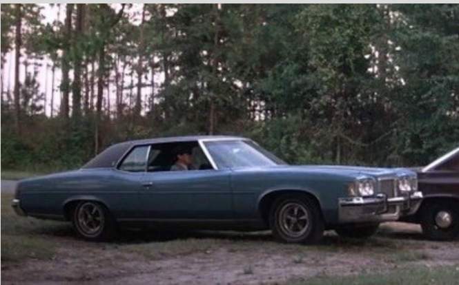
1972 Grand Ville in "Gator" (1976)