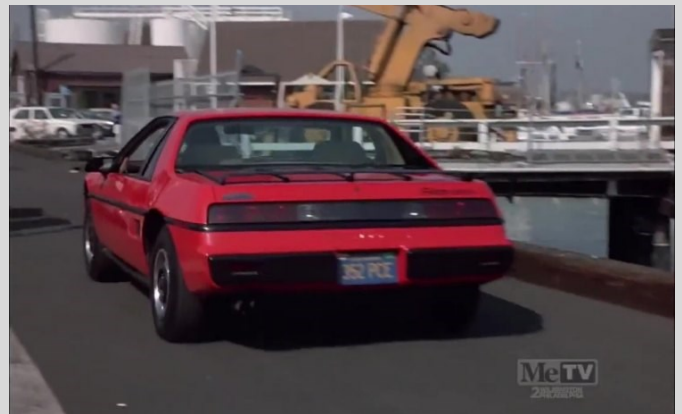
1984 Fiero in "T.J. Hooker" (1982—1986); S3.Ep19