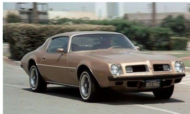
1975 Firebird in "Rockford Files"; (1974—1980); S2/Ep03