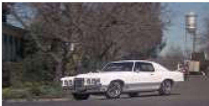
1969 Grand Prix in "Brother John"; (1971)