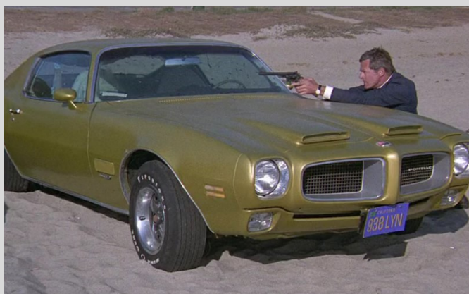
1971 Firebird Formula in "Hickey & Boggs"; (1972)