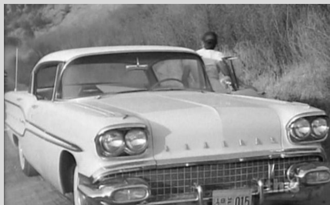
1958 Super Chief in "Highway Patrol"; (1955— 1959); S4.Ep03