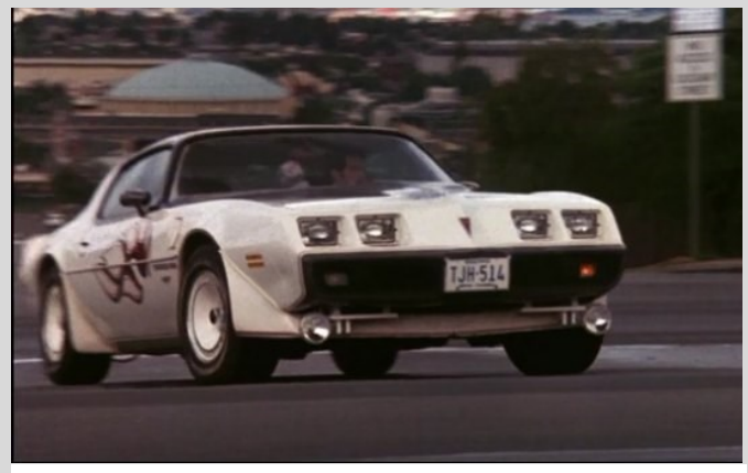
1980 Turbo Trans-Am in "Star 8o" (1983)