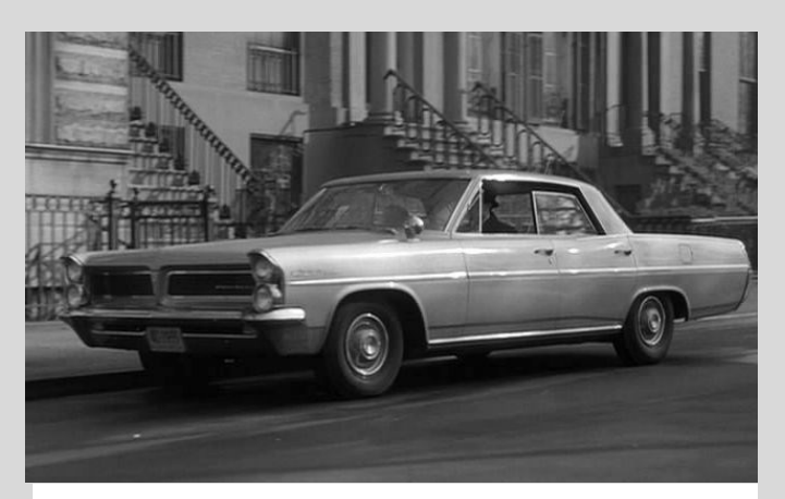
1963 Catalina in "Naked City" (1958—1963); S4.Ep14