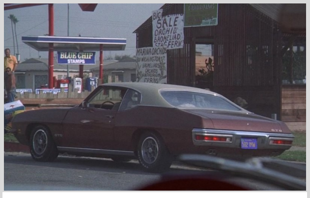
1971 GTO in "Hickey & Boggs"; (1972)