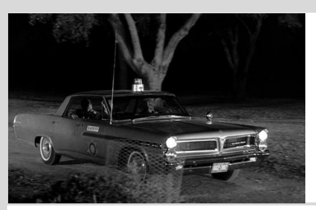
1963 Bonneville in "The Fugitive"; (1963—1967; S1.Ep10