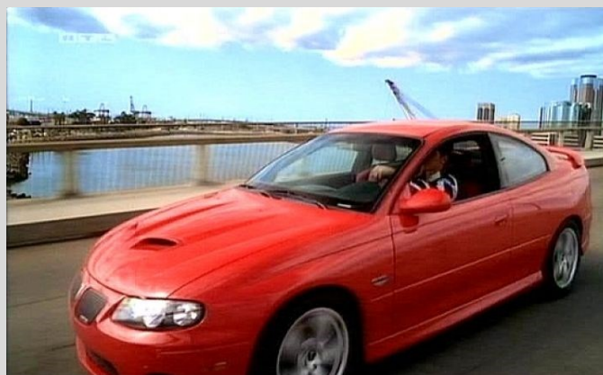
2005 GTO in "CSI: Miami"; (2002—2012); S6.Ep18