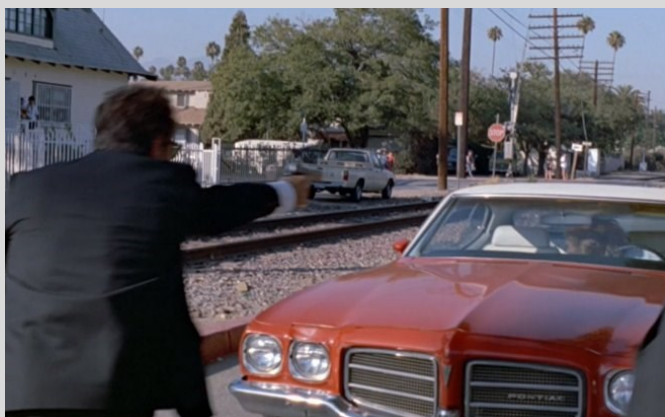
1972 Luxury Lemans in "Reservoir Dogs"; (1992)