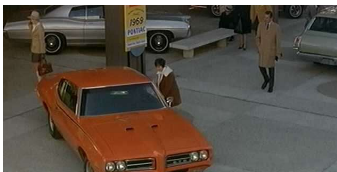
1969 GTO in "The Happy ending"; (1969)