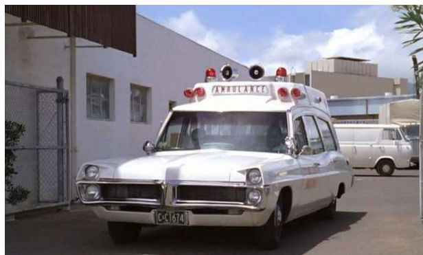
1967 Ambulance in "Hawaii Five-O"; (1968—1980); S1/Epo8