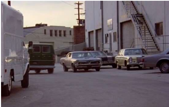
1967 GTO in "Return From Witch Mountain"; (1978)