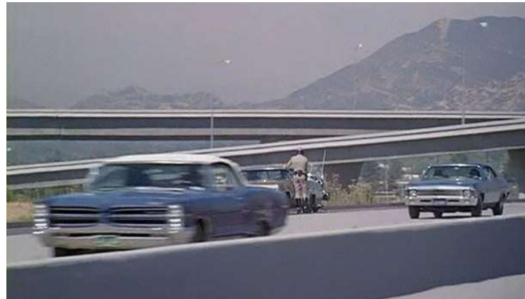
1966 2+2 in "Chips"; (1977—1983); S2/Ep10 source: Internet Movie Car Database