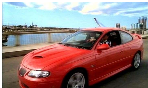
2005 GTO in "CSI: Miami"; (2002—2012); S6/Ep18