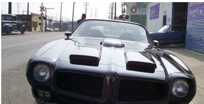
1971 Firebird Trans Am in "Corvette Summer"; (1978)